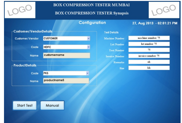
Sample Test Configuration Screen